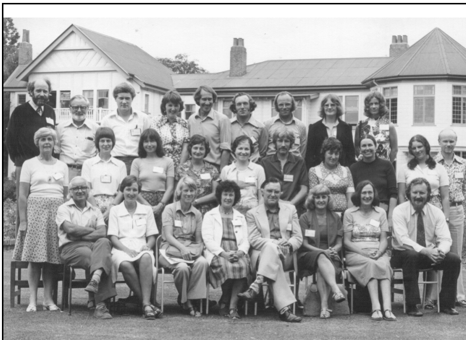
Participants at the Early Childhood Research Conference, Massey University, February 1977.